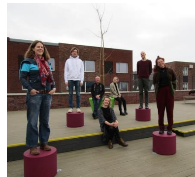
Team photo Bridge HDT Haarlem VO